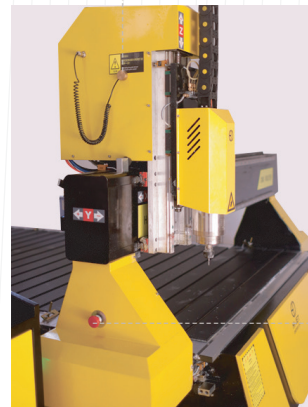
Auto Tool Height Sensor Double side Emergency Switch